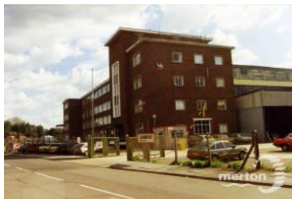
Morfax Building 2021 and 1989 (right)

General enquiries: info@mitchamcricketgreen.org.uk Web site: www.mitchamcricketgreen.org.uk Twitter: @MitchamCrktGrn