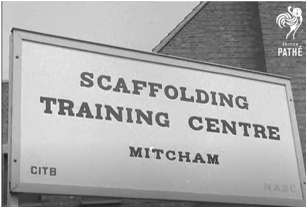
Scaffolding Training Centre - Pathe News link (1969)

https://www.youtube.com/watch?v=bbWhw9UkbbM