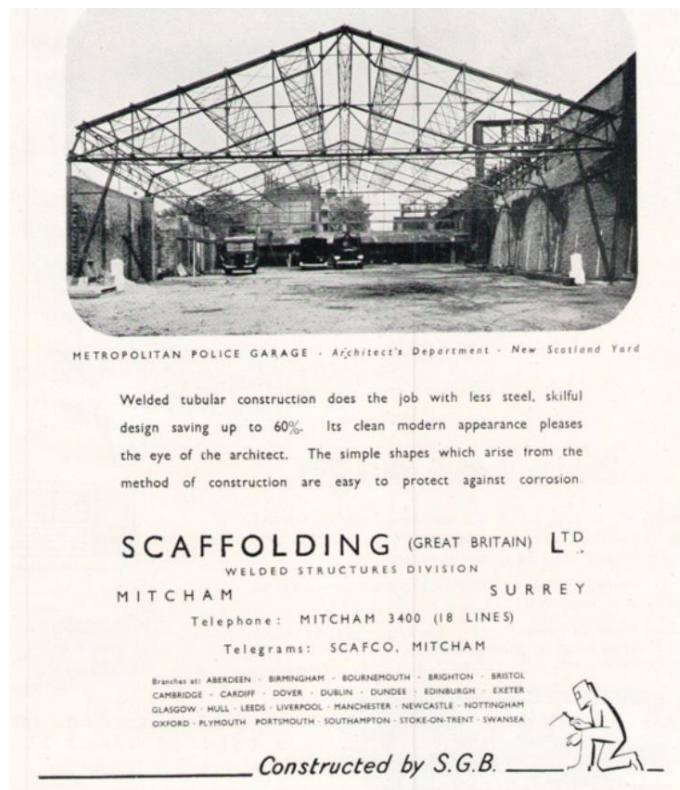
1951 SGB advertisement (Building magazine)

https://www.youtube.com/watch?v=bbWhw9UkbbM