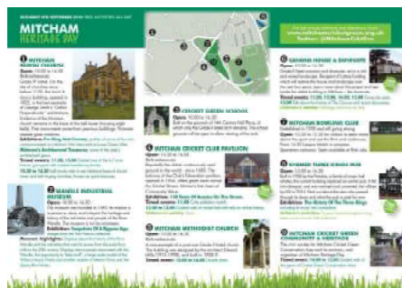
Mitcham Heritage Day 2018 saw more participating organisations than ever and hundreds of visits

We took to the wider stage in May, joining in with the Merton Heritage Discovery Day held at the Civic Centre, where our stall was packed full of information and our talk, on the topic of "Discovering The Canons and Mitcham Cricket Green" was given to a full house.