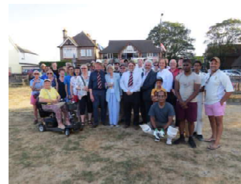
Local people and politicians join together to support Mitcham Cricket Club