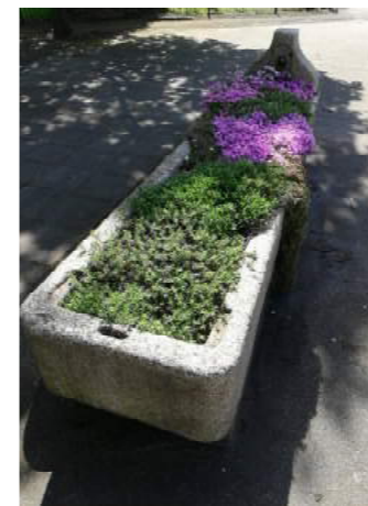
The horse trough at Jubilee Corner, which is cared for by one of our members

2018 was a challenging year for the natural environment. A wet spring was followed by an abnormally warm and dry summer that put extreme stress on trees. Not only were new plantings at risk from lack of water, but even mature specimens, including evergreens, struggled for sufficient moisture and succumbed. Where dead street trees had been replaced by the council, volunteers across the borough routinely watered the newly planted trees, with varying degrees of success. Sadly, the preferred out-sourced contractor was only seen with water bowsers on Mitcham streets when the dry spell had ended.