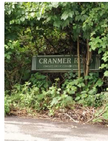
One of the Conservation Area road signs, surrounded by greenery

took place. The consequence was wet clumps of mown material being pressed into the ground by the tractor wheels. When the weather changed from wet to warm and dry, these clumps baked hard, allowing no space for the grass beneath. The hot spell had little long-term effect on grass, which can withstand long periods without water. However the clumps of compressed cuttings killed large swathes of grass, especially noticeable on the west lawn of The Canons, on Cricket Green opposite the Police station, and on the out-field of the cricket pitch which resembled a moss, weed and earth patch. There was no reseeded of damaged areas.