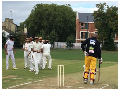
The Lashings World XI come to Mitcham

Our new Ladies team had a lively inaugural season and we hope to grow numbers in 2019. Despite all the off-the-field challenges we continue to make progress in implementing our Development Plan. Notable achievements include the restoration of artificial net facilities.