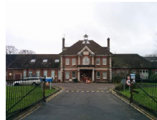
Transformation of The Wilson into a local care and wellbeing centre was frustrated by delays

Enforcement of planning safeguards continues to be an Achilles heel at Merton Council and we pressed for action on illegal parking, unauthorised development, fly tips and problems caused by the school run. We also highlighted the problems caused by a growing proliferation of estate agent boards as more flats are developed.