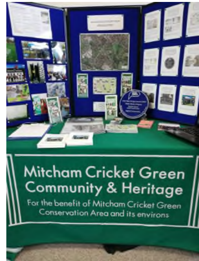
Our stand at the Merton Heritage Discovery Day in May

We were all delighted to see Mitcham Cricket Green Conservation Area come fourth in a national poll to find England's favourite Conservation Area, run by the charity for England's civic societies, Civic Voice. When you consider that there are more than ten thousand Conservation Areas in England this is a really exceptional achievement, and proves what we know locally – Mitcham Cricket Green Conservation Area is an absolute gem that's well worth all the hard work and effort people put in to look after it.